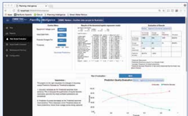
Risk modeling evaluation