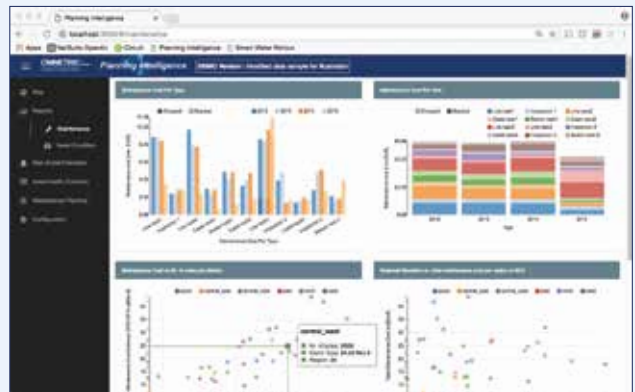
Asset characteristics e.g. age, type, maintenance activity